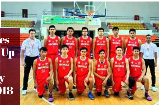
UPH Eagles Basketball Team won the runner-up place at ASEAN University Games 2018 in Naypyidaw Myanmar, 7-19 December 2018