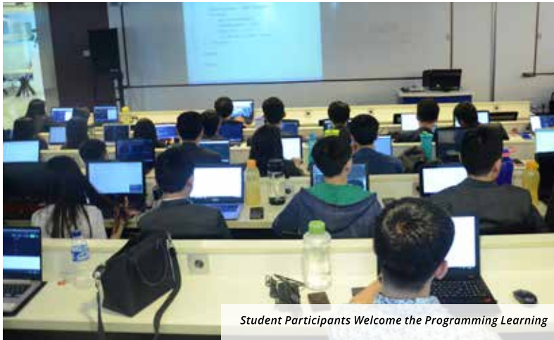
Student Participants Welcome the Programming Learning