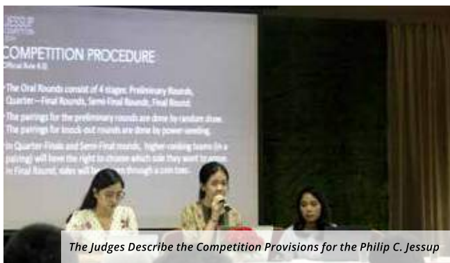
The Judges Describe the Competition Provisions for the Philip C. Jessup

Learning experience was the key message at Philip C. Jessup national round Law Moot Court event that took place at UPH Lippo Village on 1-3 February 2019. As the host, UPH was believed to have a prestigious competition and succeeded in giving a breakthrough that was able to refresh the prestigious competition that had taken place 17 this year.