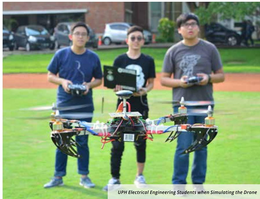
UPH Electrical Engineering Students when Simulating the Drone