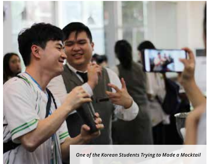
One of the Korean Students Trying to Made a Mocktail

Faculty of Tourism UPH welcomed a visit from a group of 16 Korean students who carried out practical work at the PT Heonz Royal Jaya Korea Company on January 16, 2019. UPH became the only university they visited during a visit to Indonesia.