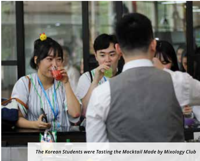
The Korean Students were Tasting the Mocktail Made by Mixology Club