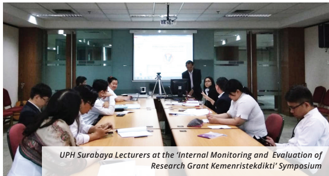
UPH Surabaya Lecturers at the 'Internal Monitoring and Evaluation of Research Grant Kemenristekdikti' Symposium