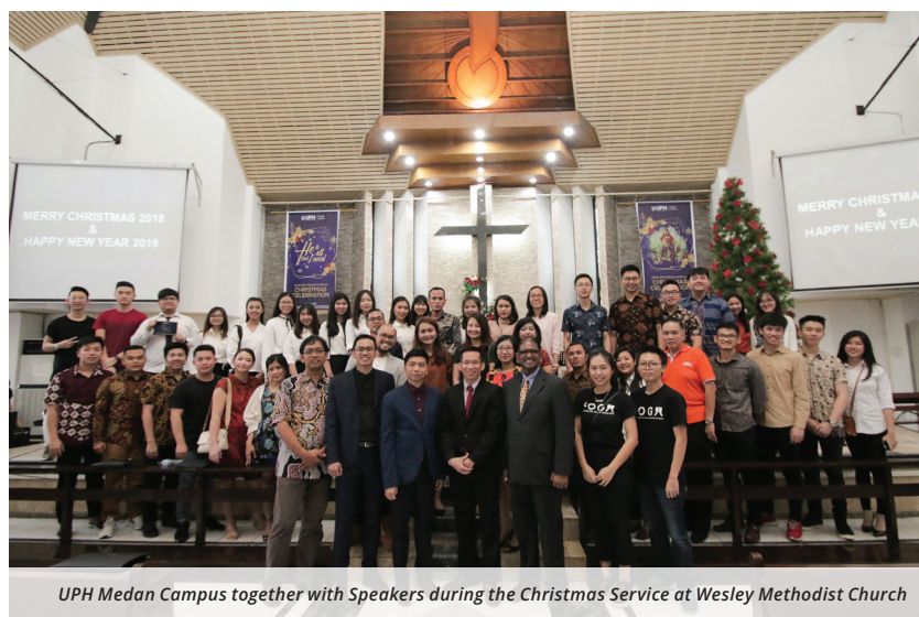
UPH Medan Campus together with Speakers during the Christmas Service at Wesley Methodist Church