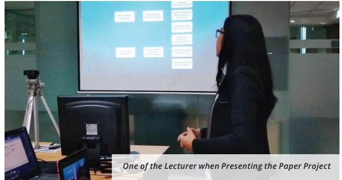
One of the Lecturer when Presenting the Paper Project

Every year, the LPPM Department of UPH Surabaya strives to assist lecturers on their research to boost research quality. This year, lecturers that have received funding from Kemenristekdikti gathered to share insights with fellow lecturers in a symposium entitled 'Internal Monitoring and Evaluation of Research Grant Kemenristekdikti'. A total of 7 lecturers received funding for the 7 papers - two from the Basic Research of Higher Education, two from Applied Leading Research in Higher Education one from Beginner Lecturer