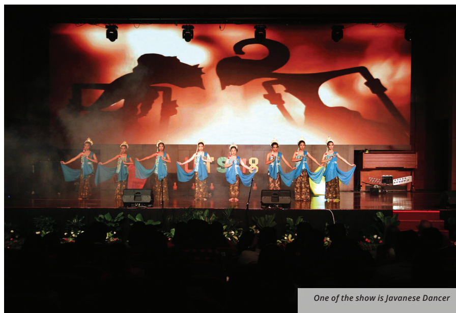
One of the show is Javanese Dancer

U PH boasts itself on nurturing its students holistically. Students get much more than academics - in UPH, they also develop their talents and potentials.