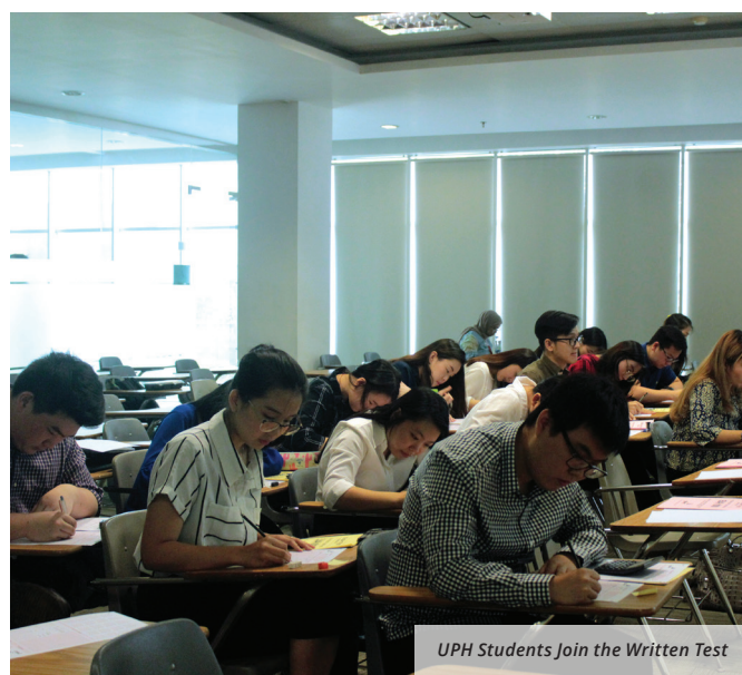
UPH Students Join the Written Test

Universitas Pelita Harapan (UPH) Career Center, with PT PricewaterhouseCoopers (PwC), one of the Big Four Accounting Firms in the world, held an On-Campus Recruitment (OCR) on Friday, October 19, 2018. Tens of UPH students flock down to the fourth floor of the C building to attend an explanation on company