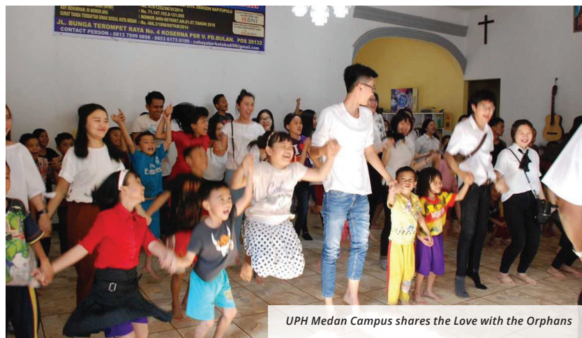
UPH Medan Campus shares the Love with the Orphans

Through this event, participants are hoped to be able to brainstorm new ideas, theories, and concepts, as well as instilling the ideal of research as a culture among educators.