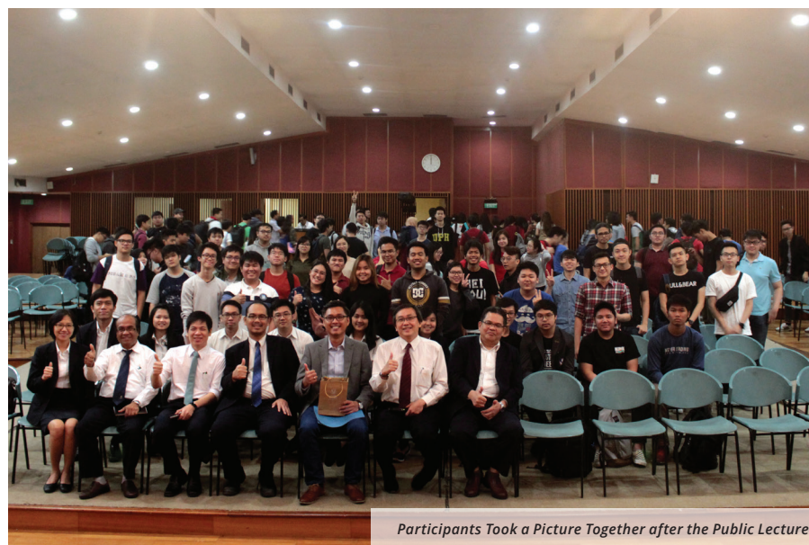
Participants Took a Picture Together after the Public Lecture