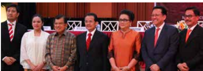
Public Defense on UPH Doctor of Law Promotion, Agustin Teras Narang, attended by Jusuf Kalla, Vice President of RI, Irman Gusman, Head of DPD RI and Ferry M. Baldan, Land and Spacial Planning Minister of RI