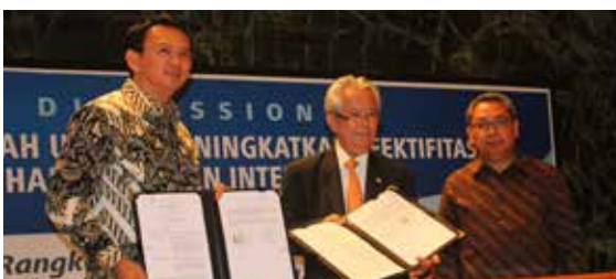
UPH Master of Law in Partnership with Pemprov DKI Jakarta in Consumer Protection Regulation Affairs and HKI