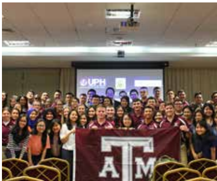
Corps of Cadet Texas with UPH International Relations Students