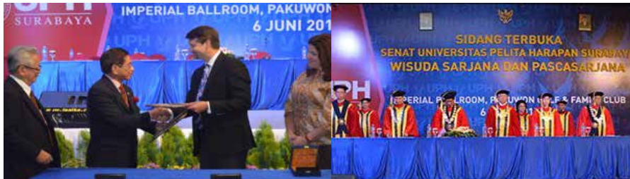
(left-right) MoU Signing between UPH Surabaya-Corban University & The 5th UPH Surabaya Graduation.