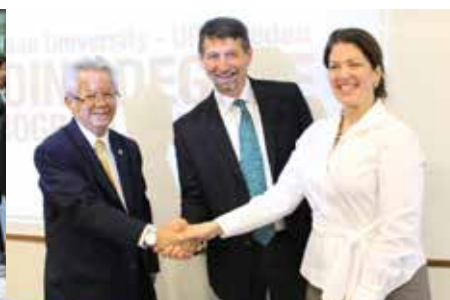
(right) MoU Signing UPH Medan – Corban University

As part of a series of campus life introductions, created especially for high school students in North Sumatera, UPH Medan hosted a Trial Class event for Management, Accounting, Hospitality, Information Systems and Law majors. This program was held from 25-29 May 2015. One interesting session was the workshop and sharing from well-