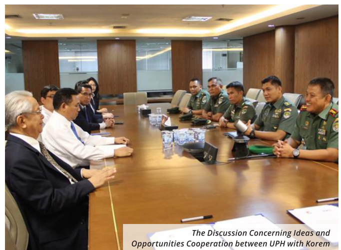
The Discussion Concerning Ideas and Opportunities Cooperation between UPH with Korem

The cooperation of UPH-Korem 052 / Wkr has the scope of the Tri Dharma Institute of Higher Education ie Education, Research, and