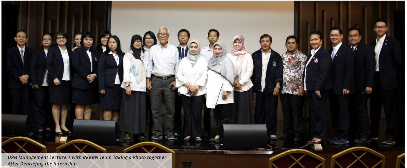
UPH Management Lecturers with BKKBN Team Taking a Photo together After Debriefing the Internship

UPH's Management department encourages its 250 batch 2015 students to apprentice in UMKMs (Micro, Small, and Medium Enterprises) partner with BKKBN (Badan Kependudukan dan Keluarga Berencana Nasional), through the UPPKS (Usaha Peningkatan Pendapatan Keluarga Sejahtera) program. Because of that, on the 23 rd of May 2018 there are debriefing for students to their apprenticeship.