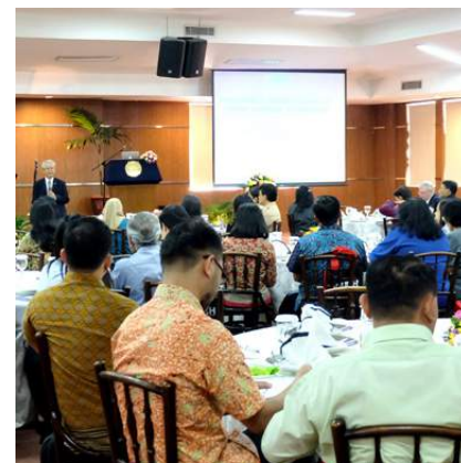
Participants of High School Leaders Gathering when Hearing the Opening of UPH Rector

UPH once again hold a High School Leaders Gathering 2018 in Universitas Pelita Harapan on 30 May 2018. This yearly event is held by the purpose to make a better relation, enrich and educate the educators and also to socialize the programs to all the high school partners in Jabodetabek. This event is attended by 68 school leaders, representatives of the 48 high schools.