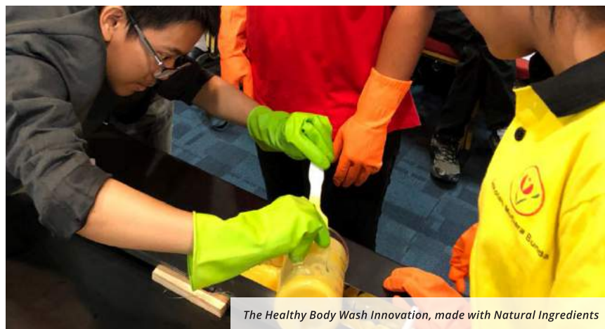
The Healthy Body Wash Innovation, made with Natural Ingredients