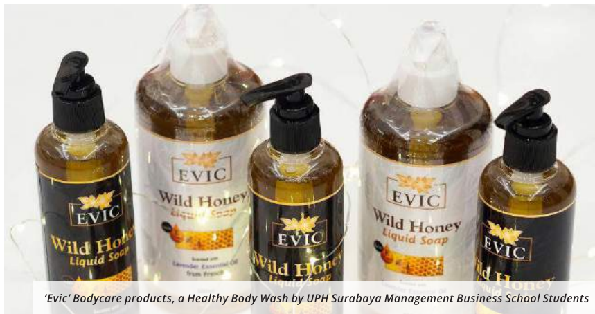
'Evic' Bodycare products, a Healthy Body Wash by UPH Surabaya Management Business School Students