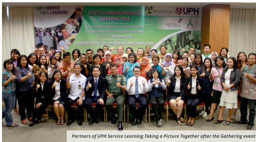
Partners of UPH Service Learning Taking a Picture Together after the Gathering event

Service Learning Student Life UPH invites representatives of foundations and Organizations who have the partnership with UPH Service Learning in the Service Learning Partners Gathering 2018 event on May 16th in MYC multi purpose room