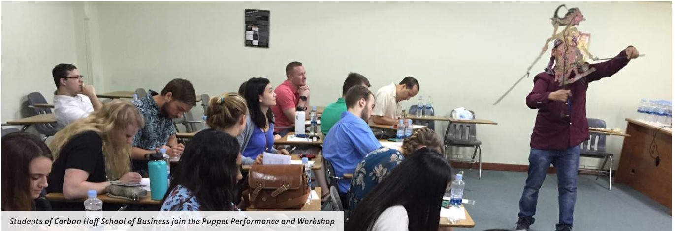
Students of Corban Hoff School of Business join the Puppet Performance and Workshop

To get a bigger picture of Indonesia's economy, Corban Hoff School of Business, a Christian university in Arizona, USA arranged a visit to UPH on May 14-18, 2018.