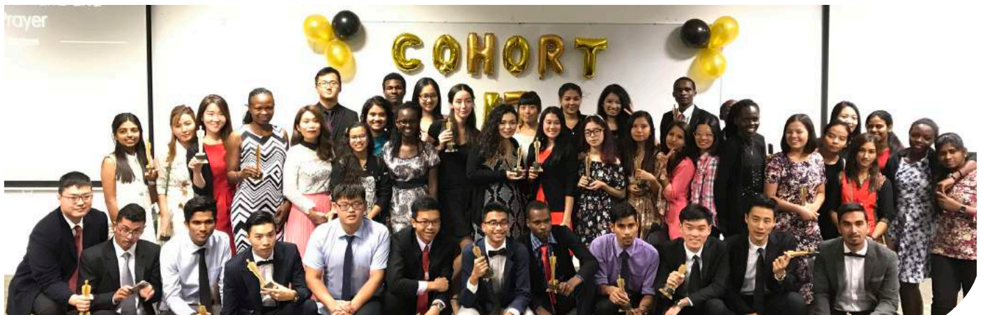
International Teachers College UPH Cohort 2017-2018

U PH as a global education university welcomes International Students of cohort 2017-2018, and one of the faculties with international students is International Teachers College. The 44 students of International Teachers College (ITC) had joined the new student orientation in the UPH Festival 24 on 16-19 August 2017. At first in ITC, they were equipped with the International Teachers College Orientation Program for 4 days. The orientation gave an introduction about ITC in greater details, and information about cultural insight in Indonesia. There was