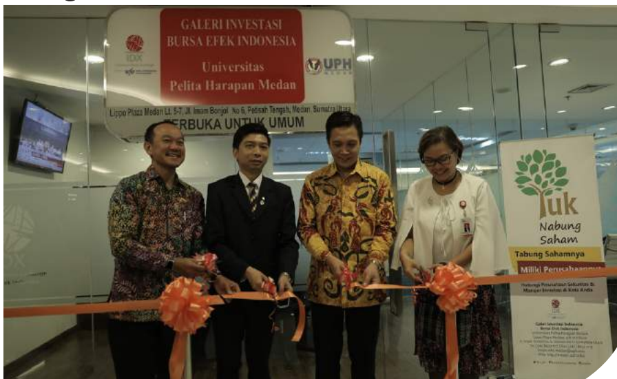
Ribbon-cutting ceremony at the Inauguration of UPH Medan Investment Gallery

In accordance with the vision of Universitas Pelita Harapan Medan in providing rejuvenation in education, especially the comprehension and knowledge in the capital market, UPH cooperates with Indonesia Stock Exchange (IDX) and PT Phintraco