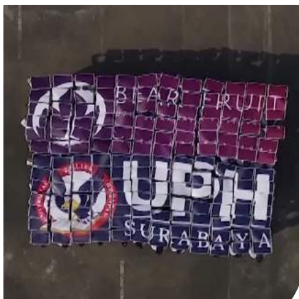
New Student Human Configuration of UPH Surabaya

UPH Surabaya welcomes new students in academic year 2017/2018 with the lively and festive event through UPH Surabaya Festival X's biggest annual event, on 14-20 August 2017.