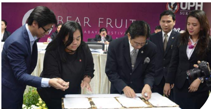
Penandatanganan MoU UPH Surabaya dengan ACCA

This is an opportunity for UPH Surabaya Accounting students to gain international recognition opportunities in the form of Diploma in Accounting and Business certificate, by only taking 2 modules from 9 compulsory modules.