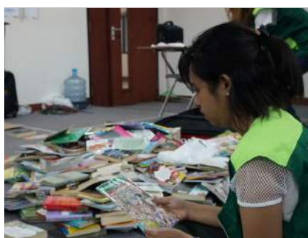
SLC UPH Member when Sorting the Books Result of the Donation from the New Students Before the Distribution

B ook donation has been a mandatory activity for the new students in UPH for the last 4 years.