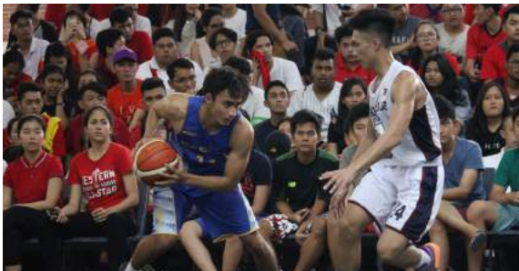
(left) UPH Eagles Player when Trying to Pass the Defense Player from Trace College in International Basketball Competition