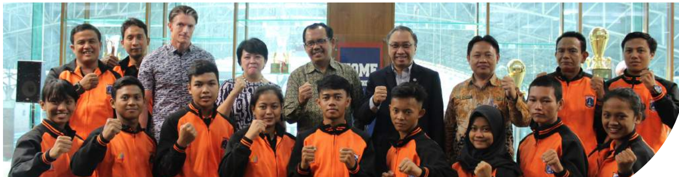
The Vocational High School Students Taking Picture along with Representative UPH, Dispendik DKI Jakarta, and Coach of Vocational School

UPH is appointed by Jakarta Education Agency (Dispendik) to provide seminars and training to 9 athletes and 100 teachers of SMK DKI Jakarta on 25-27 August 2017 at UPH Karawaci, Tangerang, as preparation in facing the National Student Sports Olympiad (O2SN) SMK 2017 which will take place in Medan on 3-9 September