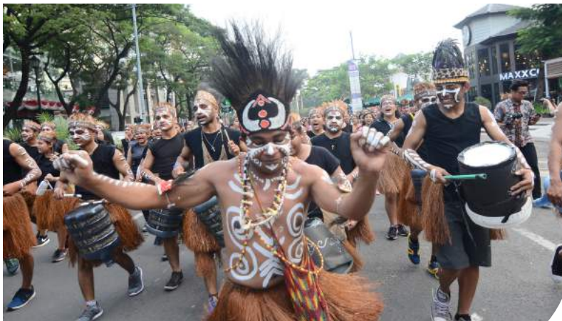
Papua Dance Presented by UPH Student Group Teacher College at the 72th Independence Day Parade, was selected as the 'Best Costume'