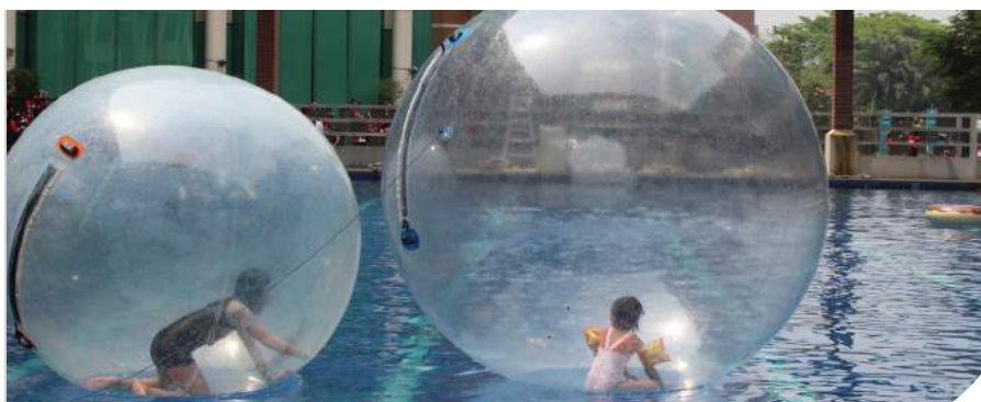
Fun Activities Enliven 'UPH Alumni Fun Day' Event