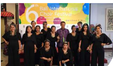
CoM UPH Students in BICF 2017

UPH Representative at Bali International Choir Festival (BICF) 2017, took home 5 gold obtained from UPH Choir team, 3 gold medal and Voxcom Femme Conservatory of Music UPH team donated 2 gold medals.