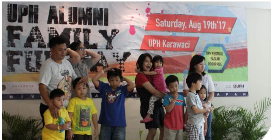
UPH Alumni from Various Cohort Gathered Together in 'UPH Alumni Fun Day' Event at UPH Festival 24

In addition to welcoming new families and students of class 2017, UPH Festival 24 is also addressed in the public and UPH alumni from various forces.