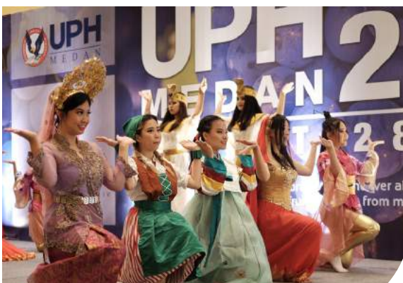
Student Performance - UPH Medan Festival