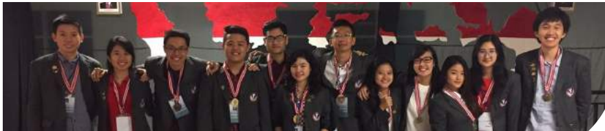
FK UPH Team in RMO 2017 Competition

FK UPH successfully defended the overall champion position in the Regional Medical Olympiad (RMO) 2017 at UKRIDA FK, Jakarta, on 18-21 August 2017. FK UPH outperformed the other team by earning 3 golds, 2 bronze, and 1 silver.