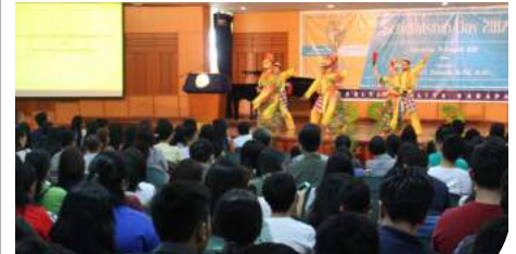
Performance of Regional Dance by UPH Students at Scholarship Day 2017

During UPH Festival 24, the UPH Marketing and Admission Department held a series of events for high school students, teachers, and parents.