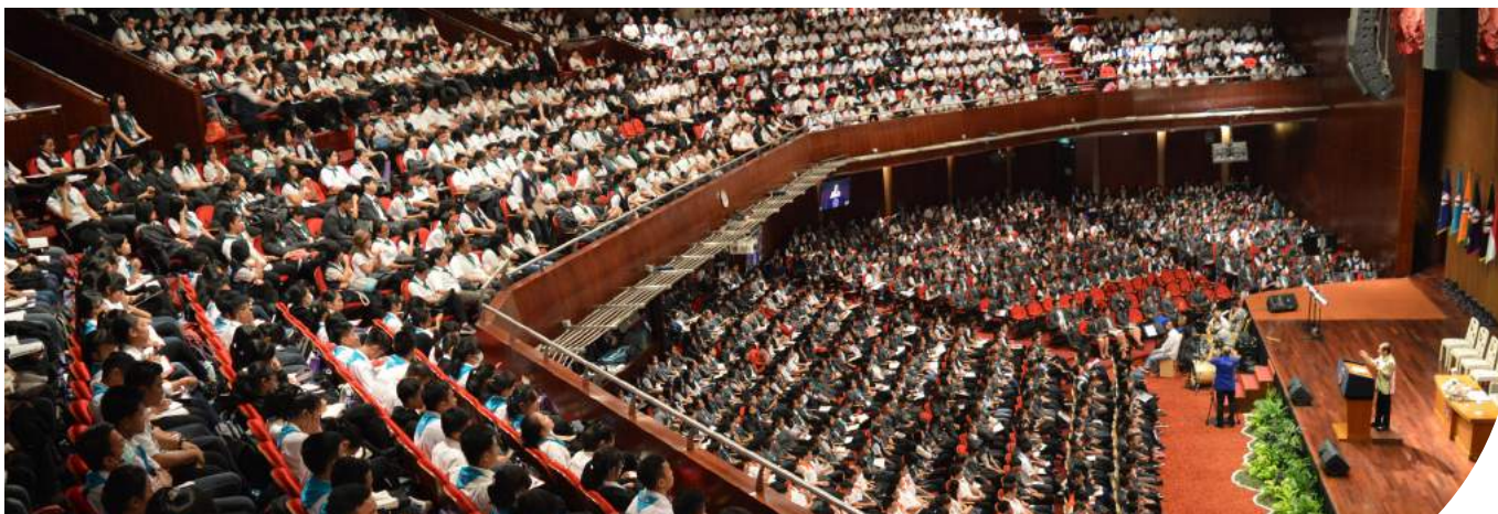
New Students attending the Morning Devotion by Pdt. Yung Tik Yuk at Grand Chapel, August 16, 2017