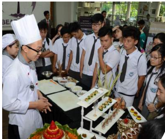
STPPH Academic Showcase: The Exhibition of Various Processed Cuisine