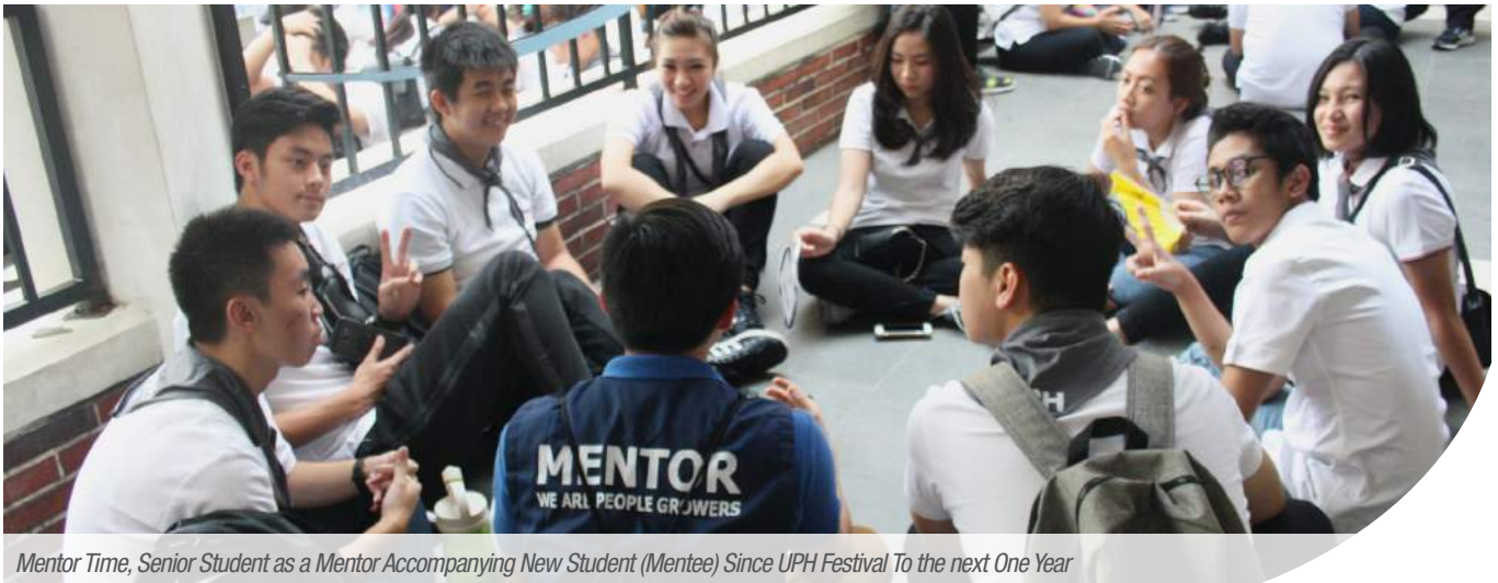
Mentor Time, Senior Student as a Mentor Accompanying New Student (Mentee) Since UPH Festival To the next One Year