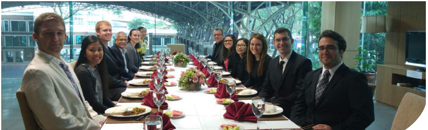
Welcome Lunch for All Biola University Students

U PH once again hosts Biola University students' internship in Siloam Hospital and MRIN on 13 – 31 July 2017. This internship is in partnership between UPH and Biola University.