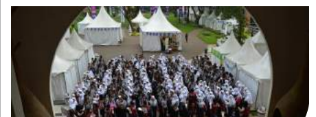
High School Students Gathered Together Before Attending the Open House

The teachers who come can also attend the various workshops to gain skills and insights in various fields. It is expected that through this event, parents, students, and teachers will get to know UPH and can recommend the campus, and make UPH as the first choice to continue to the college level.