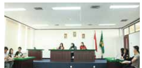
Moot Court Simulation During 'Experience of UPH' for The School of Law

Each month, 'Experience UPH' will be held for the different department. In February, it would be started with Communication Department and Law Department, which was followed by 53 students on February 18, 2017. Afterward 'Experience UPH' will be held on March for the School of Hospitality and Tourism UPH.