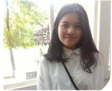
11th Grade Student of Al-Izhar Pondok Labu

This was my first time in UPH and also in participating in a Political Debate Simulation Workshop. I have gotten a great amount of knowledge from this activity. I now could understand what debate is, in theory and the practice itself. Through a simulation like this, I could know which part do I need to fix and I was taught the correct ways. This was an interesting, useful and practical experience for me. I will gladly recommend my friends to join the events held by UPH."