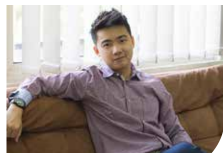
Creative Director POCIX Creative Web Agency

Since I was in college, I have worked on several web orders from a number of clients who are also my colleagues in college. In UPH networking is widely opened. Along with my friends, I have done many projects with cheap offers. Many times, we would get clients from quite renowned companies. Those experiences were very useful for me, for I add a great point for my portfolio. I believe this is one of the advantages that you could get in UPH; aside from prestigious education from experienced lecturers."