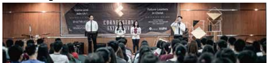
360 UPH Students Following The Cornerstone Initiative That Was Designed as The Foundation of Leadership

Cornerstone Initiative (CSI), a leadership training that was designed as the foundation of leadership for UPH student. CSI that was held on February 10th-11th, 2017 was unique since CSI focused on bringing participants to understand the importance of Christ-Centered Leadership. Approximately, 360 students followed this training and most of them