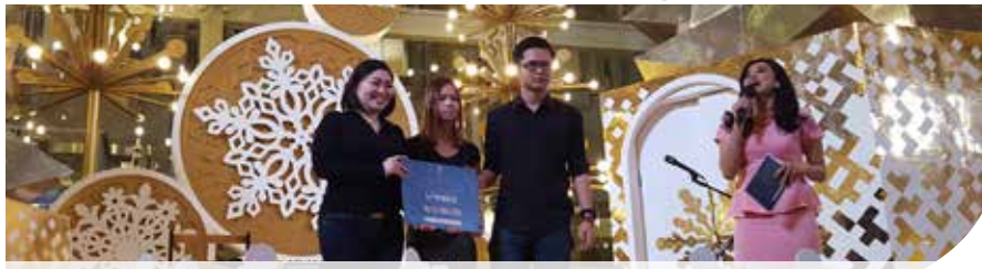
Team of UPH VCD Won 1st Place on 'Jakarta in Motion' 2016

Students of VCD Department from UPH School of Design have successfully achieved three awards on 'Jakarta in Motion' competition, which was held on August 18 until December 1, 2016. Two of UPH VCD teams have successfully become the first and third winner of the competition, while the other team won an award for 'Best Concept'.