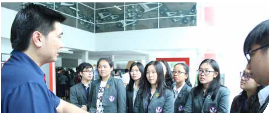
The Representative of PT Daihatsu was explaining about Working and Service System in Astra to Students of UPH Medan

UPH Medan held a company visit to one of Astra Group subsidiary, PT. Daihatsu Medan, on January 16, 2017. This activity was a part of Student Life Department program, which aims to provide students with new insights in various fields of profession and business process in the automotive industry. Approximately, 20 students who were also members of various students’ organization such as BEM, HMJ and HMF UPH Medan were present at the