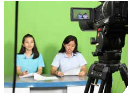
News Presenter Workshop during 'Experience UPH' for the Communication Department

The Marketing Team of UPH always has its own creative approach towards High School students. This time, UPH Marketing Team presents a series of an event called 'Experience UPH', an event where High School students are able to learn about the departments available in UPH through general knowledge, theories and practice. Hopefully, High School students who were able to take this opportunity could learn and obtain new experience about the learning process in UPH, so that they can choose what they will take in college later on. The first program of 'Experience UPH' was held for Communication Department and the Faculty of Law on February 18, 2017 at UPH Karawaci, Tangerang.