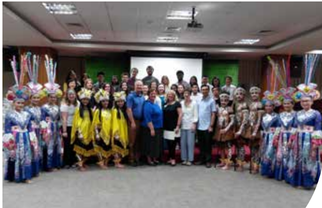
Calvin College Delegation with The Students of UPH

Earlier this year, UPH welcomed Calvin College delegation, consisting of 16 students from various majors and 2 lecturers, who visited and explored several cities in Indonesia as part of their Interim Program abroad. The program, namely Truth & Reconciliation: The Artist Response, aims to look at intersections between social justice issues in a developing