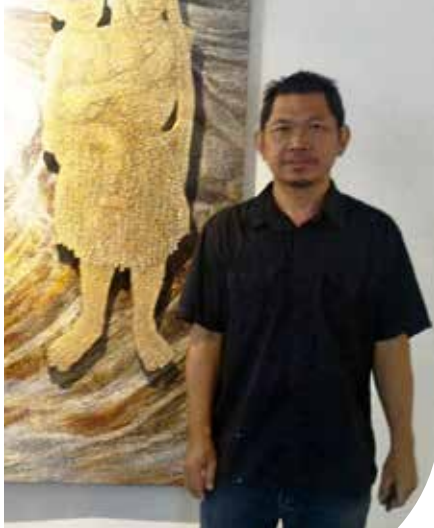
Artist from Seruni, That tells about The Condition of Papua

Art can become a means to convey certain message. Any condition in this world, including the political and social ones that Indonesia is currently facing, can be an inspiration for artists. Through these artworks, I and fellow artists from Seni Rupa Kristen Indonesia (SERUNI) Community wanted to speak to many people about the reality where one's spirituality value is measured from their sensitivity upon responding towards the sufferings happening around their life. Moreover, we also want to remind people that the center of everything in our life is Jesus and as we can see from Matthew 25:35, Jesus represents himself as fellow unfortunate people. This was the main message of 'Ketika Aku' Painting Exhibition which we held in along with UPH School of Design in UPH Campus. Surely, as artists, we might feel satisfied when our artwork could be understood by people. But we hope for something more than just an under, we hope that our artwork can change their way people view things and we also hope that it gives them enlightenment, so they can be a more sensitive about their surroundings