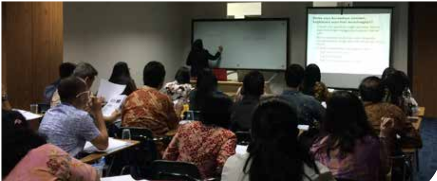
Student Counselor Training was followed by 35 High School and Junior High School Teachers in Surabaya

In response towards the raising issue regarding social media addiction among High School and Junior High students, thus, on Friday, February 17, 2017, at 12.00-16.00, UPH Faculty of Psychology Surabaya, held a workshop for Student Counselors for High School and Junior High School around Surabaya and Sidoarjo; the event was held at the Auditorium of UPH