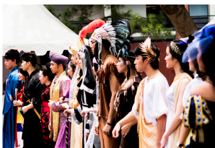
Performance of Traditional Clothing Parade, presenting the cultural diversity and characteristics of countries of the world

International Community for Students (ICS), an organization that opens up opportunity for UPH students to establish relationship with international students, so that ICS held an annual event called Cultural Day. This year, the event was held in a large scale and named as ICS Cultural Week 2015. Carrying the tagline of “Culture across Borders”, ICS conveys the message that there are a lot of cultures in the