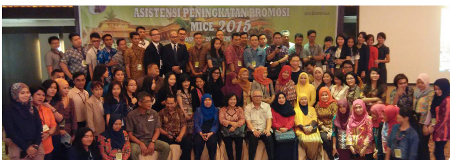
Group Photo with all participants of MICE Seminar 2015

N ine students of Hospitality Management UPH Medan got opportunity to participate in "the Assistancy of Increasing Promotion of MICE" that was held by Minister of Tourism of Republic of Indonesia at Grand Emerald Hotel Medan, starting from September 17-19, 2015. Besides students of both state and private universities, the seminar was