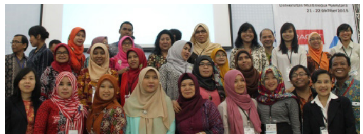
Synergies of UPH, UMN, and SGU held PKM National Conference and CSR 2015 on October 20-21, 2015.