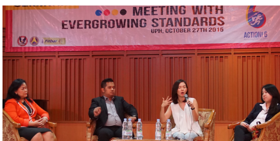
Seminar "Meeting with Overgrowing Standards" in 'Action'6', an annual event of Accounting Department