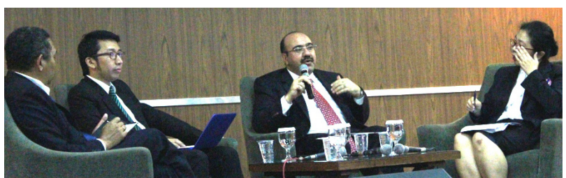
International Relation Fiesta 2015, the biggest annual event of International Relation (HI) UPH, inviting Ambassador of Kingdom of Jordan for Indonesia, HE Ambassador Walid Al Hadid (second from the right) in Seminar of 'Optimizing Relationship with Middle East'