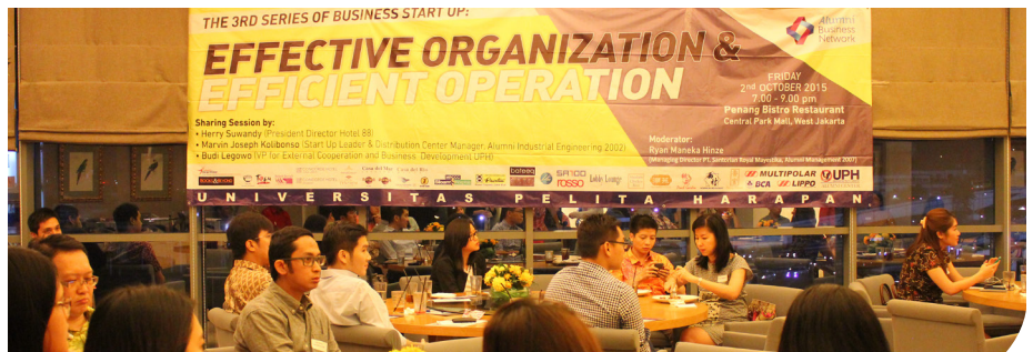
Participants of Alumni Business Network "Effective Organization & Effective Operation"