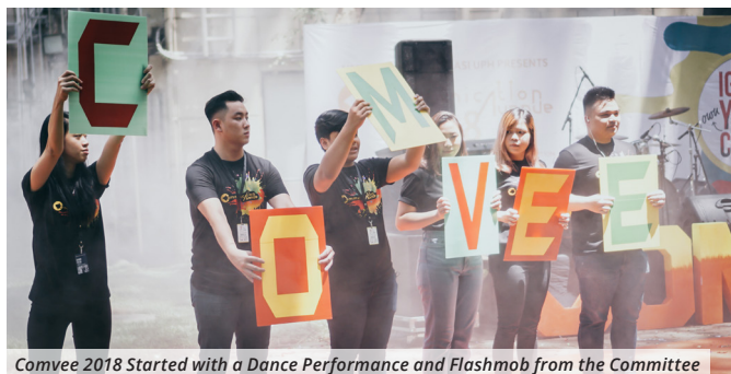
Comvee 2018 Started with a Dance Performance and Flashmob from the Committee

Himpunan Mahasiswa Program Studi (HMPS) Universitas Pelita Harapan Communication Science (Universitas Pelita Harapan Communication Science Student Council) (Ilkom UPH) held a Communication Avenue (Comvee) 2018 on September 3-8, 2018, at UPH Lippo Village, Tangerang, with the theme "Ignite Your Own Color". This event is the biggest agenda of the year, boasting a wide variety of communication-related activities such as a Digital Marketing seminar, media company visit, a recruitment of new UPH Radio members, and