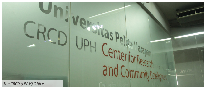
The CRCD (LPPM) Office

U niversitas Pelita Harapan (UPH)'s performance of Penelitian dan Pengabdian Masyarakat (P2M) has improved continually through the years. In 2010-2013, the work of P2M UPH puts them in the ranks in the Binaan cluster. In the year 2013-2016, they managed to get into the Madya cluster, and since 2016, it has gone to the Utama cluster, which entitles UPH to receive and manage a penelitian unggulan desentralisasi perguruan tinggi, or a scheme of a decentralized research system.