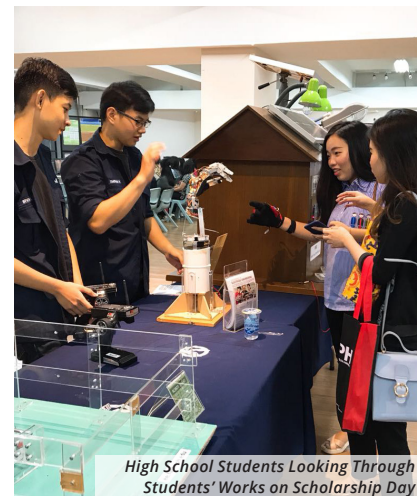
High School Students Looking Through Students' Works on Scholarship Day

UPH Marketing and Admission Department holds a Scholarship Day every Saturday from August 25 up to September 25, 2018. This program gives more prospective students a chance to secure a scholarship of up to 100%.