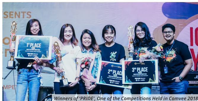
Winners of 'PRIDE', One of the Competitions Held in Comvee 2018

Himpunan Mahasiswa Program Studi (HMPS) Universitas Pelita Harapan Communication Science (Universitas Pelita Harapan Communication Science Student Council) (Ilkom UPH) held a Communication Avenue (Comvee) 2018 on September 3-8, 2018, at UPH Lippo Village, Tangerang, with the theme "Ignite Your Own Color". This event is the biggest agenda of the year, boasting a wide variety of communication-related activities such as a Digital Marketing seminar, media company visit, a recruitment of new UPH Radio members, and