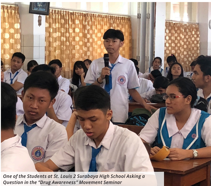
One of the Students at St. Louis 2 Surabaya High School Asking a Question in the “Drug Awareness” Movement Seminar

The fact that crimes involving drugs are happening in an exponential rate is one of the main reasons why UPH Faculty of Law wants to increase awareness on the dangers of drugs to school-age students. As a tangible action of this awareness, some of UPH Surabaya’s school networks collaborated to hold the “Drug Awareness” Movement seminar on October 5, 2018, at St. Louis