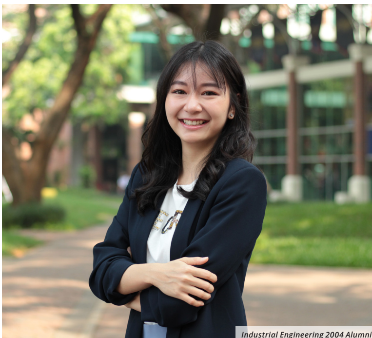
Industrial Engineering 2004 Alumni