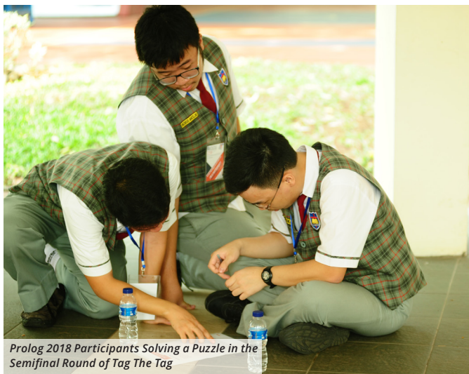
Prolog 2018 Participants Solving a Puzzle in the Semifinal Round of Tag The Tag

UPH School of Information Science and Technology (SISTECH) conducts the yearly event National Programming and Logic Competition (PROLOG 2018) for high school students on September 24-27, 2018. This event looks to develop students' logical thinking as a basis in decision-making skills, especially if the student is looking to continue his/her studies in computer sciences.